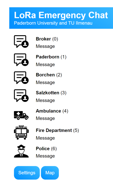
Figure 2. Example of our chat system which lists all currently available chat channels on the website of the captive portal accessed by the end devices, e.g., smartphones.

The general routing concept of our approach is divided into two different phases. Initially, every node gets assigned a fixed unique ID, which is used for addressing in the context of our routing approach. This could be achieved by, e.g., deriving this ID from the MAC address of the IEEE 802.11 WLAN module in the node. Once a new node is joining the network, it has to