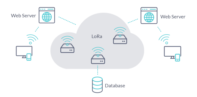
Figure 1. Structure of our network architecture for crisis communication using LoRa. The network can be easily expanded by introducing additional nodes to the network.

WLAN communication technology to allow end devices (e.g., smartphones) to access the LoRa network via a web server running on those nodes. Further, those nodes are responsible to build and maintain a multi-hop routing scheme in order to scale the network over larger distances. Additionally, the network consists of a dedicated broker including a database to store data of the communication and help bootstrapping and maintaining the multi-hop network. This dedicated broker, however, could reside on a normal LoRa/WLAN node as well.